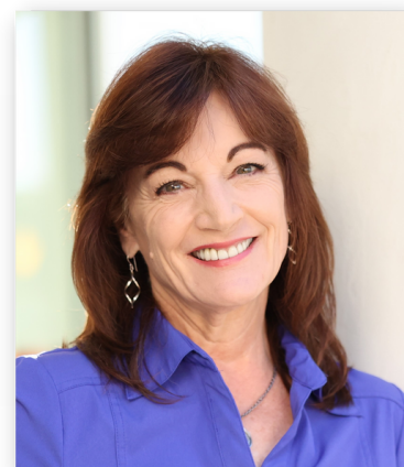
Suzi Pagel Foundation Innovation LLC