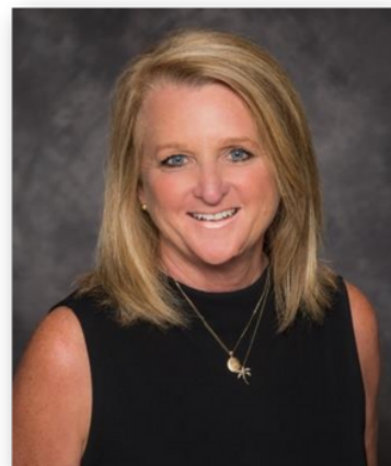
Valerie Foster Sanger Education Foundation