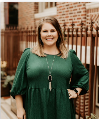
Chelsea Ormond Comal Education Foundation