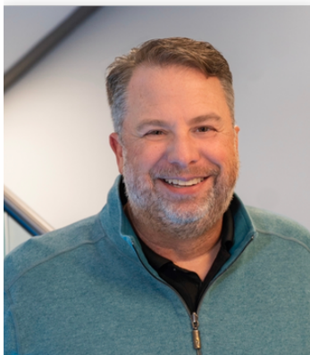
Shawn Callaway Foundation Innovation LLC