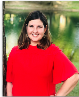
Ashley Sine McKinney Education Foundation