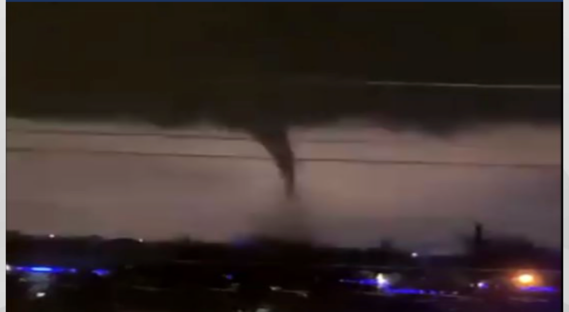
Dallas Tornado Causes Significant Damage Sunday Night

Foundation ED had been on the job for three weeks